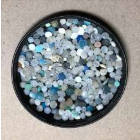
A batch of nurdles, small plastic pellets used in the plastics manufacturing industry, that are often found making their way as pollution into Lake Ontario and pose a threat to fish and wildlife.

Additionally, Rochelle explained, the nurdles themselves can attract and absorb toxins which then means that these toxic tidbits are contaminating the waters of Lake Ontario. And that is a matter of concern because Lake Ontario is the source of drinking water for over 9 million people. Additionally, when the pellets are consumed by fish for example the toxins are then transferred to the fish itself.