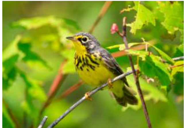
Two Ontario Bird Species at Risk found in the area of this project. Cerulean warbler on the left. (Photo: Terry Mcburnie, eBird). Canada Warbler on the right. (Photo: Josiah Vandenberg, eBird)