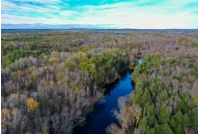
Hastings Wildlife Junction, ON.

Located in southern Ontario, this 5,000-hectare project is the critical next step to lessen the impacts of climate change and biodiversity loss