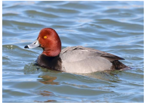
Redhead, One of the New Species Found on This Year's CBC

How wrong can one person be? Apparently if you are me the answer is “very.” I expected that this year’s count would have low numbers. I expected that birds would be scattered through the area and hard to find because they wouldn’t have to concentrate around sources of food and shelter. I certainly expected something different than what actually happened.