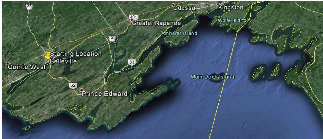
Map by Google Earth

It really is the issue that will not die. Should wind turbines be built in ecologically sensitive areas? Kingston Field Naturalists have calculated that over 1000 turbines are placed or planned in eastern Lake Ontario defined as Prince Edward County and the part of the lake contained by the chain of islands which includes Main Duck Island. Here's a brief look at three of those projects.