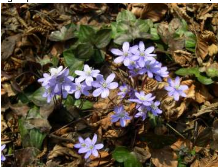
Cheer up. Hepaticas will soon be blooming.

There is another key difference in the three projects. It's one thing to launch a lawsuit against a faceless government landowner. Clearly even that has raised considerable rancour in Prince Edward County. It would be a different matter to try to stop a project which has a considerable financial benefit for a next door landowner.